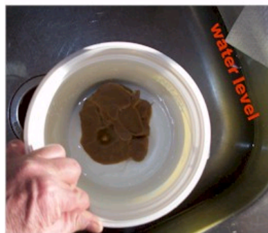
Spread wax over hole