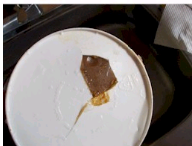
underside of bucket